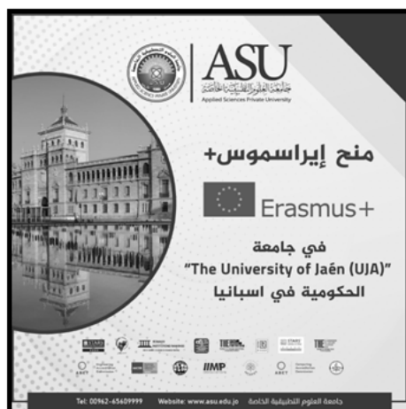
Students Mobility to the University of Jaén (Spain)

Application Deadline: 17 th of October 2021 @ 12:00 noon